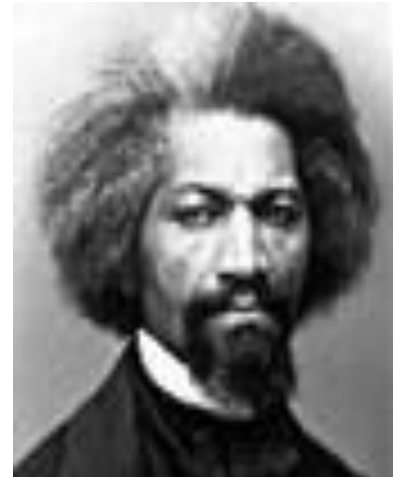
Frederick Douglass 1817-1895 Abolitionist, Orator Statesman