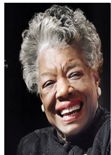
Dr. Maya Angelou 1928-2014 American Author, Poet, Dancer and Singer