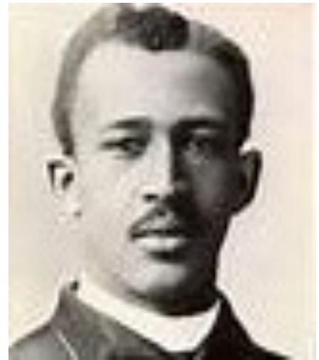
W.E.B. DuBois 1868-1963 Author, Scholar and Organizer