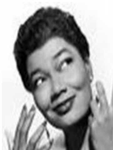
Pearl Bailey 1918-1990 Singer Actress, Best-selling Author