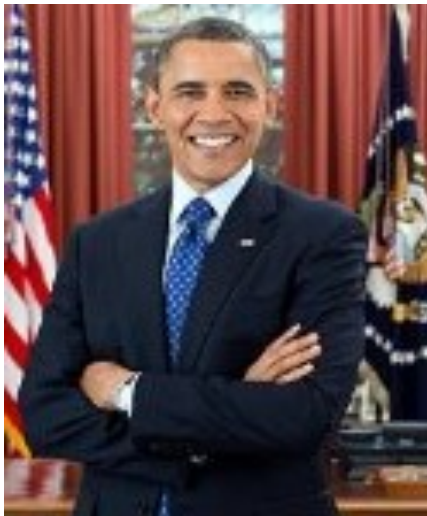
Barack Obama is the 44th and current President of the United States. The first African American to serve as U.S. President. First elected to the Presidency in 2008, he won a second Term in 2012.