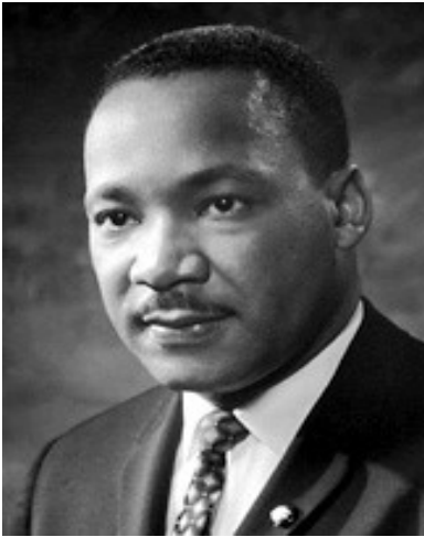
Dr. Martin Luther King Jr. 1929-1968 Civil Rights Leader Pastor and Founder of Southern Christian Leader Conference