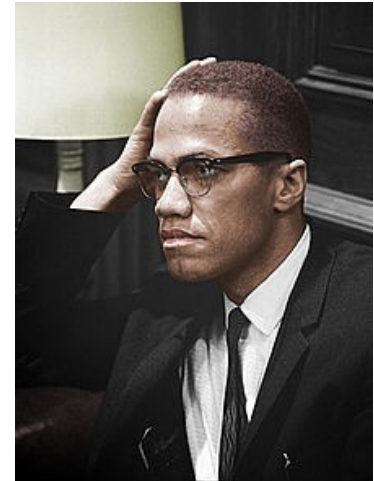
Malcolm X 1925-1965 Human Rights Activist