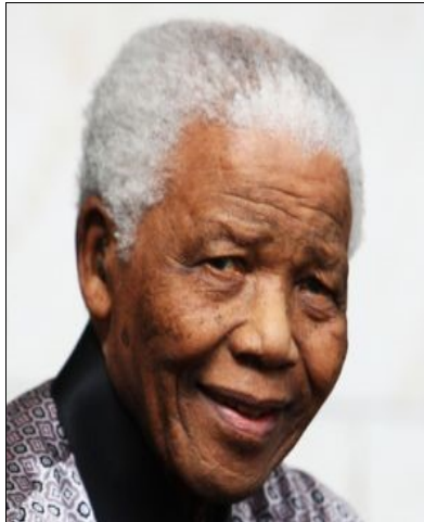
Nelson (Rolihlahla) Mandela 1918-2013 Statesman, Humanitarian Father of his Country's Freedom