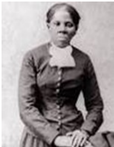
Harriet Tubman 1821-1913 Moses of Fugitive Slaves