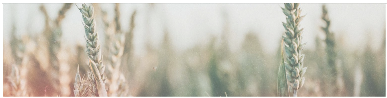
Grateful people are happy people

November is often referred to as Gratitude Month. It's a time when we give thanks for all the blessings in our lives.