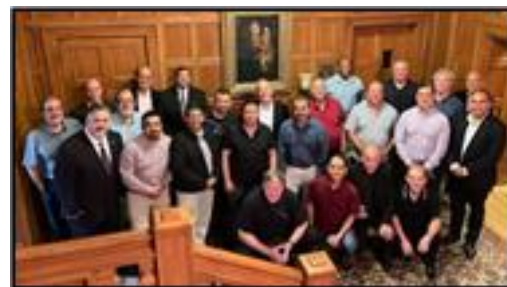
Cardinal Tobin meets with class