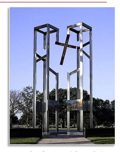
The 9/11 Memorial at Holy Cross Cemetery and Mausoleum in North Arlington offers a peaceful place for visitation and prayer.

Whom are you remembering this afternoon? Here, 9/11 was more than a national tragedy for the people. Here, the carnage